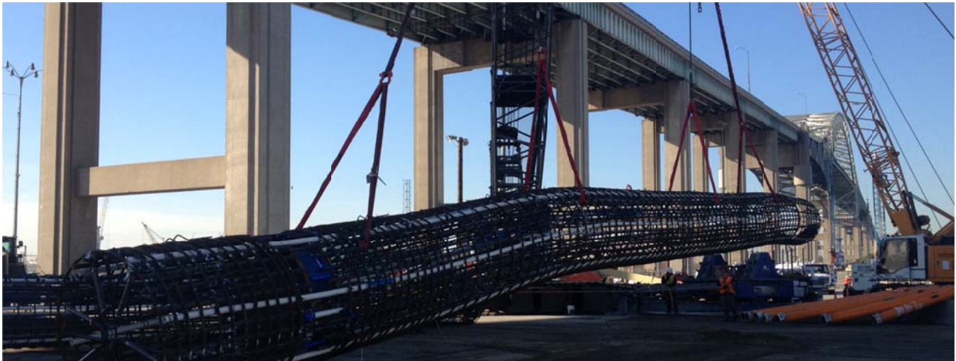
Lifting the Assembly